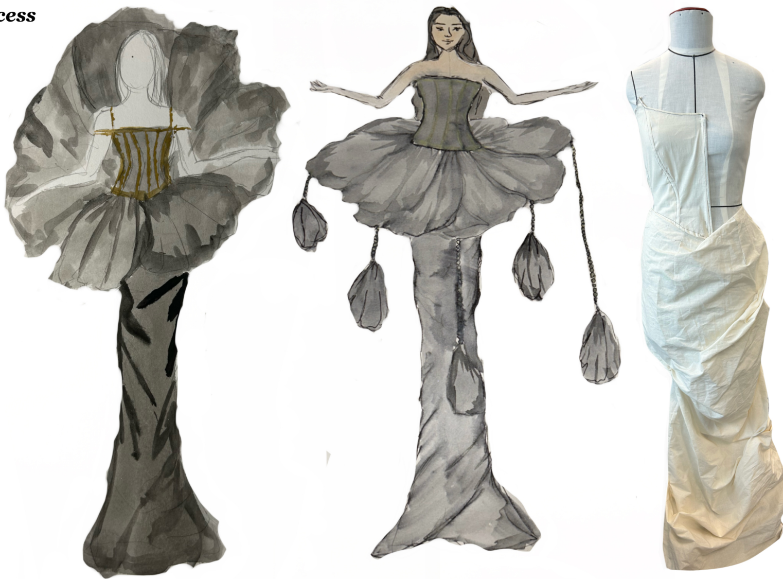
First sketches inspired by the volume of a withering flower